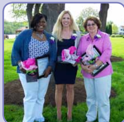
Mary Griswold Award Winners

What happens here changes lives forever.